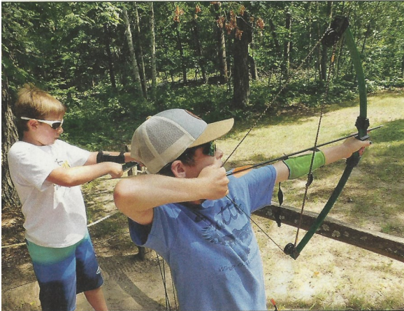
TWO BOYS PRACTICE THEIR SKILLS AT ARCHERY, which is one of the outdoor activities that children from the ages of nine to thirteen can take part in at the Minnesota Elks Youth Camp each summer.