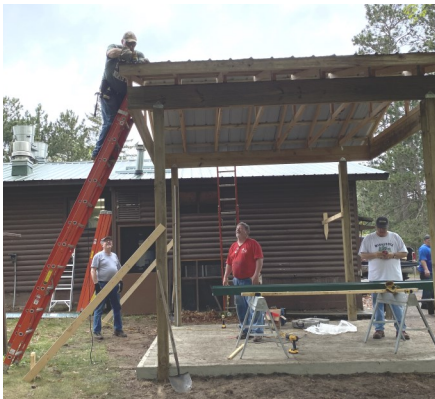
Members of Red Wing Lodge constructing the shelter for the new walk in freezer