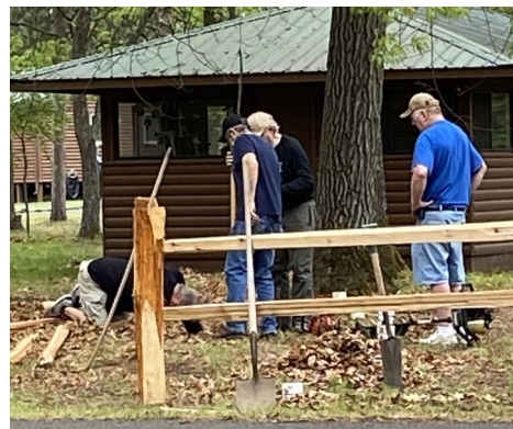
Members of Hutchinson Lodge & Alexandria Lodge replacing fence posts throughout camp